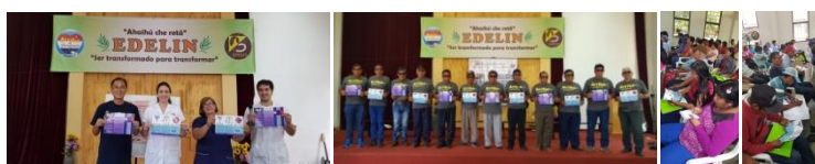
Photo: The first temperance seminar, held at the 23 rd Tribal Chiefs' School during November 4-8, 2019.