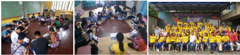
Photo: The three day event, ‘Evangelism for the Youth’ (October 29-31, 2019) where 50 counselors and helpers in yellow shirts served 151 young participants.