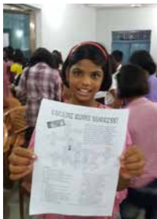
Above: Worksheet says, "Cocaine Ruins Success."