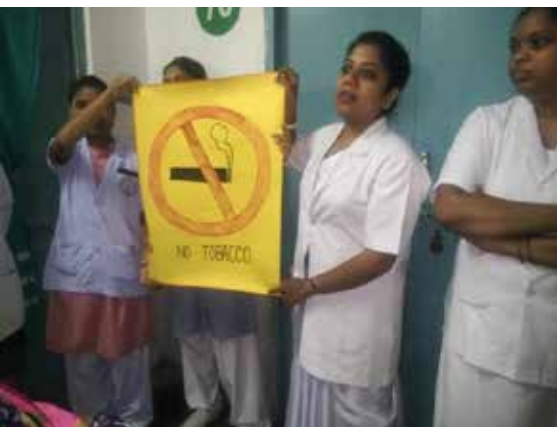
Top right: No tobacco