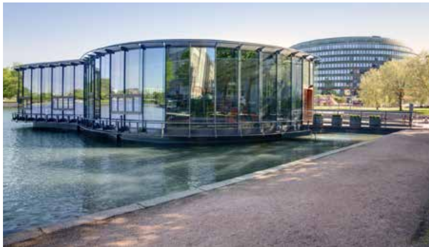
Restaurant Meripaviljonki, Helsinki