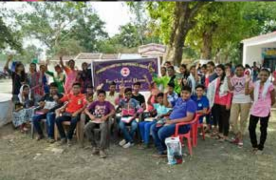
Right: A group of young people with the WCTU India banner.